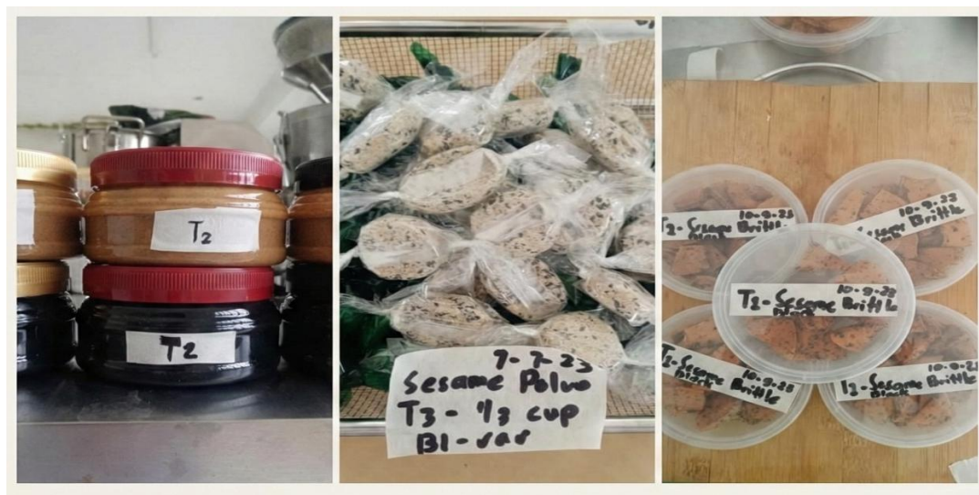
Figure 2. Sesame-Based Products Developed Through the Project (Black and Brown Sesame Butter, Sesame Polvoron, and Sesame Brittle)